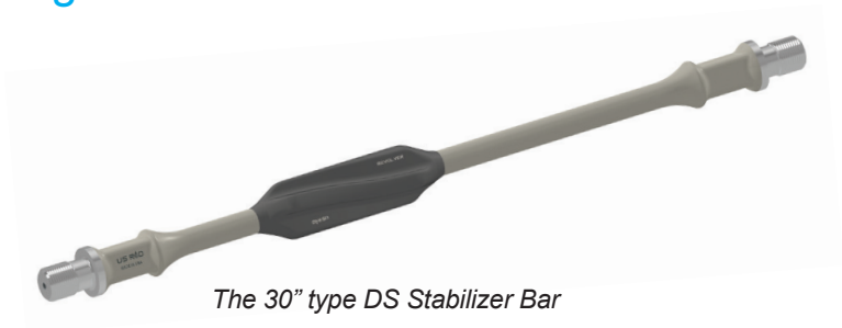
The 30" type DS Stabilizer Bar

US Rod Stabilizer Bars are recommended to centralize your pump plunger during the downstroke, reducing drag and lowering the chance of premature wear on pump parts and tubing. US Rod Stabilizer bars can also reduce buckling tendencies, improving your downhole pump efficiency and resulting in more production. Available in 30 in or 48 in lengths with one Bullet EX guide (30 in) or 3 Bullet EX guides (48 in). Other rod guide designs available upon request.